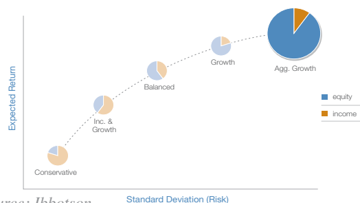
Source: Ibbotson The Aggressive Growth Portfolio is expected to have higher return expectations accompanied by higher risk compared to the Growth Portfolio, which is anticipated to have lower returns accompanied by decreased risk.